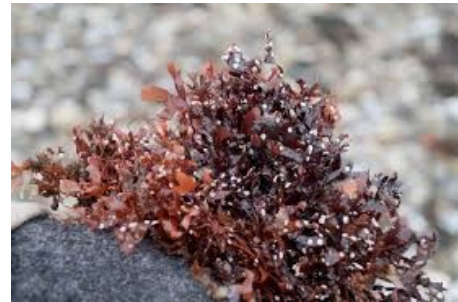
Pioca ou chondrus crispus