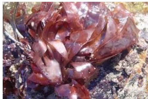
Palmaria palmata ou dulse